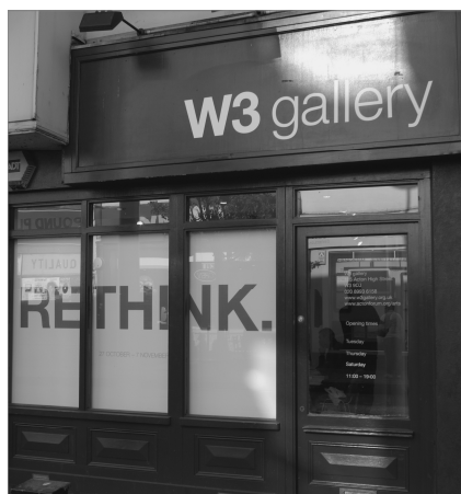
'Rethink' at W3 Gallery, Acton High Street

The Churchfield Community Association welcomes people living and working around Churchfield Road who are interested in making a difference to our area