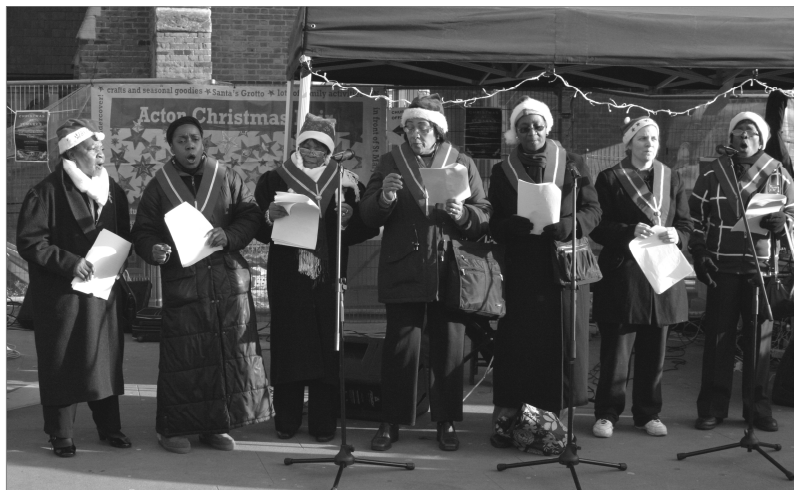
Acton Hill Gospel Choir at the Acton Christmas Fair

The gods smiled on us for a second year at Acton Christmas Fair, under a clear blue sky on Saturday 10th December. Inside two massive marquees, heaving with 21 market stalls, and five gazebos,