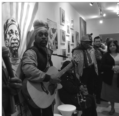
'Momentum' Black History & Culture Exhibition

The W3 Gallery on Acton High Street opened its doors in September 2012. Our aim is to promote local talent and we hope many Actonians will submit work and visit our exhibitions.