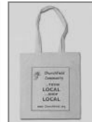
Free CCA bag