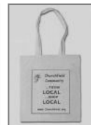
Free CCA bag See website