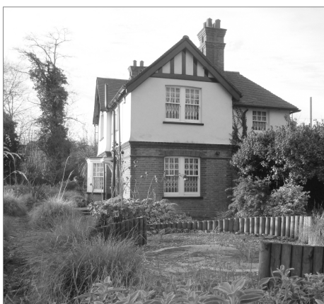
The rangers' house with mosaic garden

Rangers are responsible for park patrols, public safety, dealing with incidents, unauthorised events and vehicles, nature conservation tasks, infrastructure defects and anti-social behaviour. They are first point of call for the public;